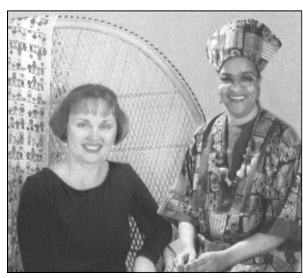
The Many Faces of Tales, a storytelling duo consisting of Foust.

During the festival, prizes will be presented to the winners of a Character Poster Art Contest sponsored